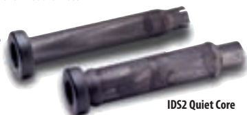
IDS2 Quiet Core