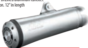
4" Aluminum Series

4" External tunable disc mufflers. Brushed aluminum canister. Comes with Tri-Brackets to weld on. 12" in length