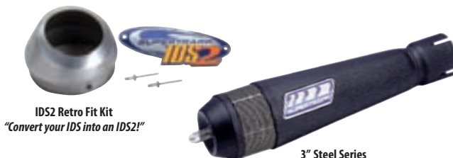
IDS2 Retro Fit Kit