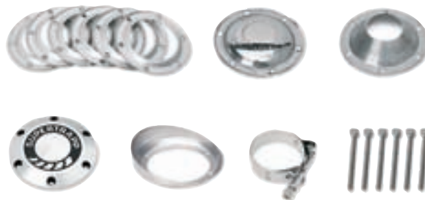
See page 384 for optional COLORED end caps!