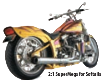
2:1 SuperMega for Softails