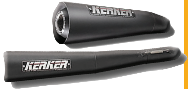
For Pricing and Van Leeuwen Part #s, see page 394

Choose from a brushed stainless, black coated or chrome finish. Whatever Meg Series exhaust you choose, you'll get the power, performance & unmistakable sound of a classic that still knows how to rock.