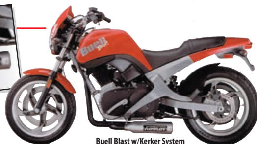
Buell Blast w/Kerker System