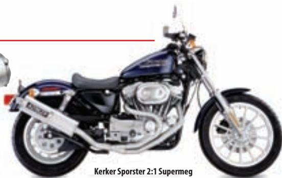
Kerker Sporster 2:1 Supermeg w/Brushed Aluminum Canister