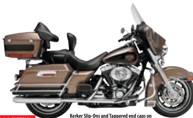
Kerker Slip-Ons and Tapered end caps on HD Ultra Classic Electra Glide