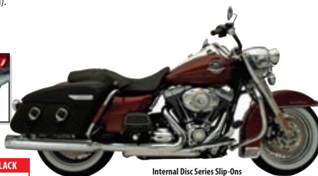
Internal Disc Series Slip-Ons w/Fishtail End Caps on H-D Road King