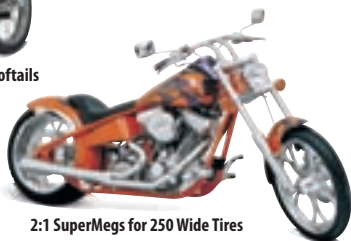
2:1 SuperMega for 250 Wide Tires