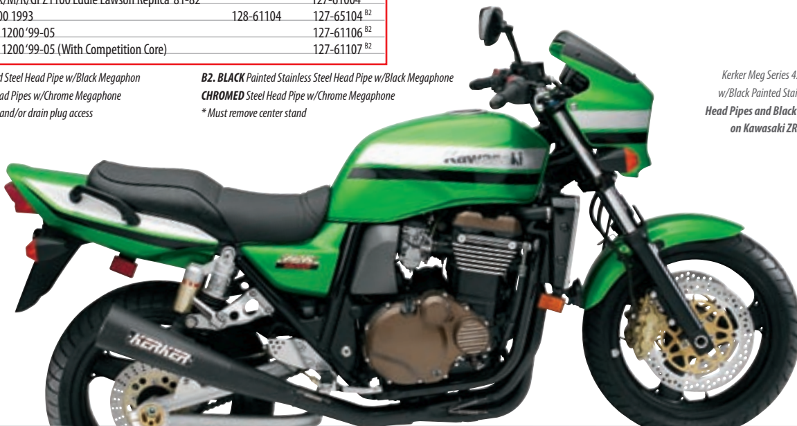
Kerker Meg Series 4:1 System w/Black Painted Stainless Steel Head Pipes and Black Megaphone on Kawasaki ZRX1200

*Prices are subject to change without notice