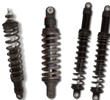
BMW Kawasaki Can-Am Spyder